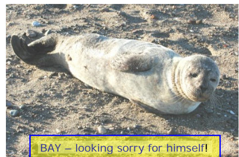
BAY – looking sorry for himself!